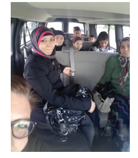
We were able to take this group of families school shopping thanks to Clinton Valley Assembly of God. Money raised through VBS in August was used to take 8 children shopping before school started.

Since 2015 it is estimated that over 10,000 refugees from all over the world have come to the Metro Detroit area. President Trump has approved another 45,000 in the next year to the nation with an estimated 3-5 thousand coming to Metro Detroit. The Detroit area is the 4th largest destination for refugees to this country. God is asking us to bring hope to refugees. Refugees need hope! We are bring hope by providing for needs and building relationships with these that have come to our area seeking refuge from their war torn, dangerous counties. We are showing the Middle Eastern Refugees that we encounter, the love of Christ. We are helping them get acclimated to our area by providing for their needs of transportation, learning the language and build relationships with them to better share the truth about who Christ is. Here are a few of the things that we have been able to do through the provision of our partners in ministry.